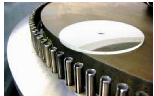
Retracted Pin-Drive Ring Gear