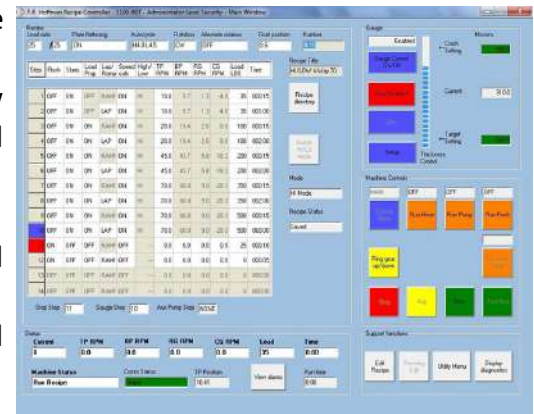
RecWork TM Software Interface